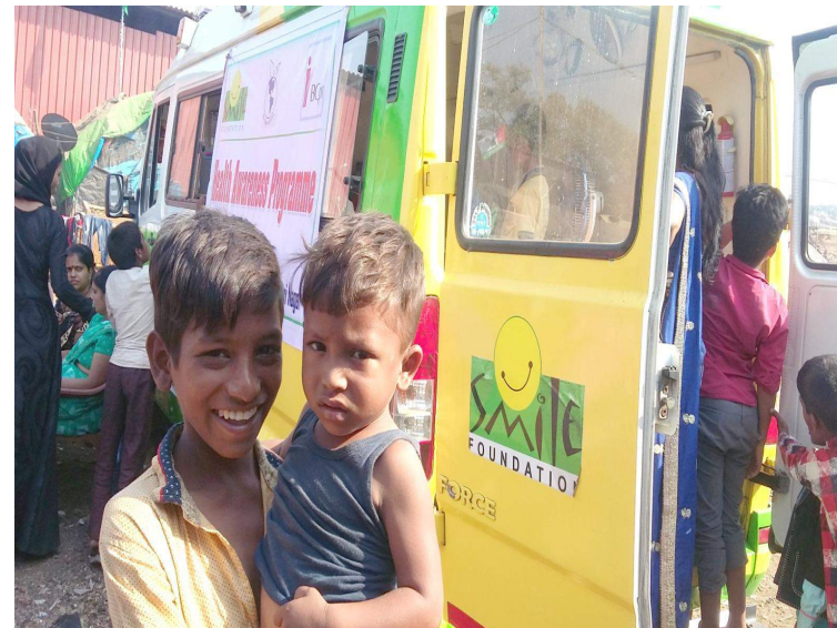
Public Awareness on various programs