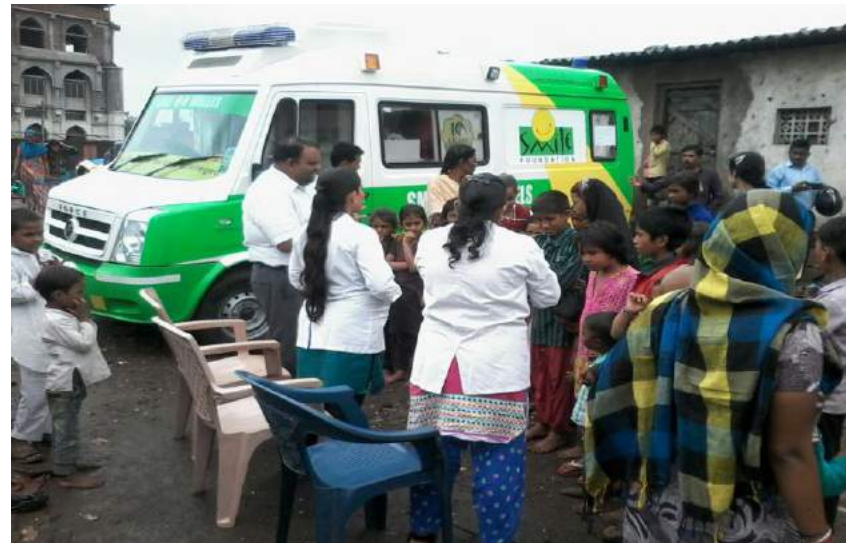
Medical Health Check-up