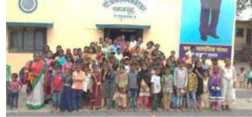
National Child Labour Project