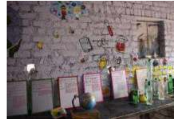
A Nirman Laboratory Made From Waste