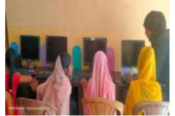
Rag Pickers And Orphans Digital Training