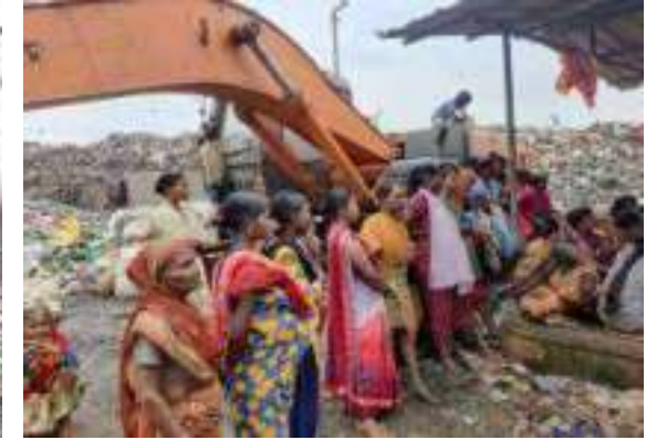
Rag Pickers And Orphans Community Survey