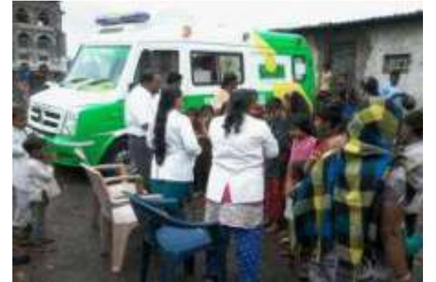
Medical Health Checkup