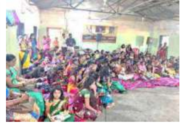
Woman Empowerment Program