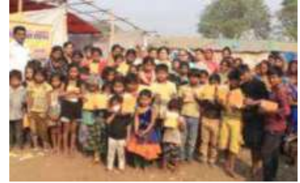
Education Kit Distribution